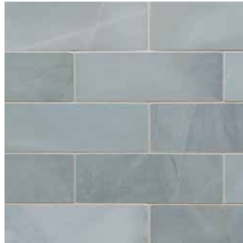
Cadet Blue Honed 3" x 8" field