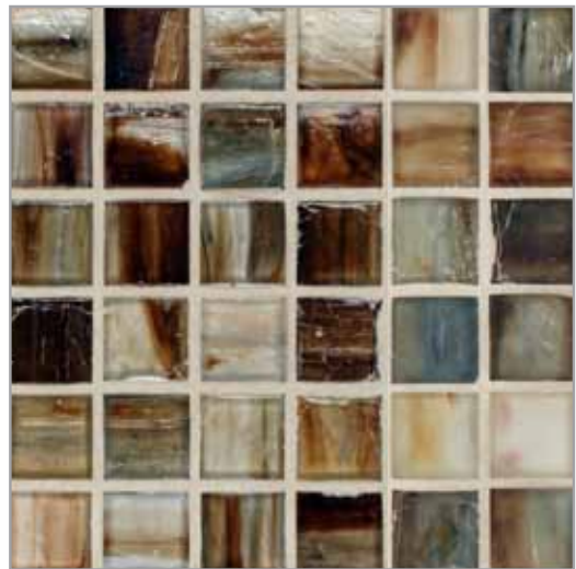
Natural | Silk Copper