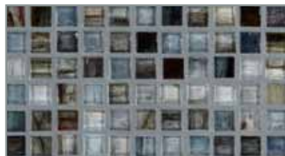
1/2 x 1/2 Mini Mosaic (11.5mm x 11.5mm)