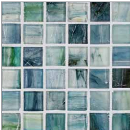
Natural | Silk Erbium