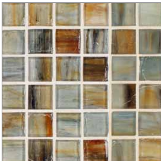
Natural | Silk Xenon