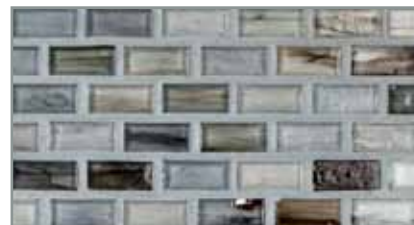
1/2 x 1 Mini Brick (11.5 mm x 25mm)