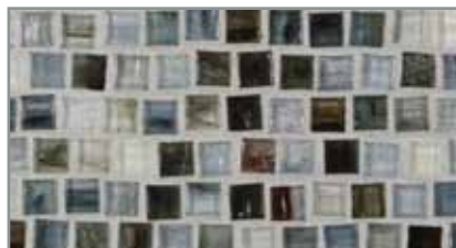
Pompeii (1/2 x 1/2) (11.5mm x 11.5mm)