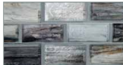
1 x 2 Brick (25mm x 50mm)