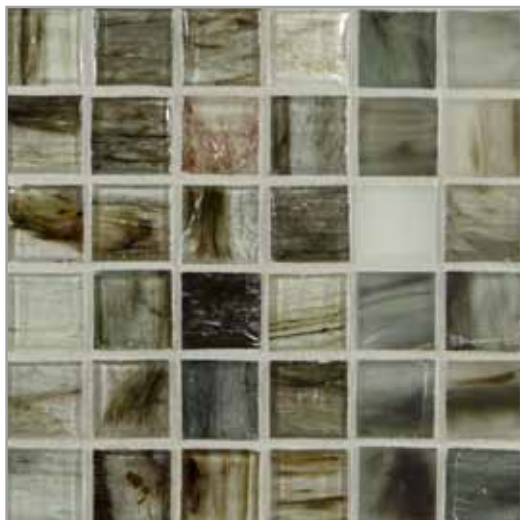
Natural | Silk Vanadium