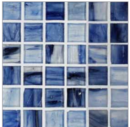
Natural | Silk Antimony