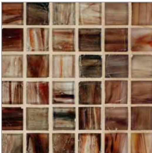
Natural | Silk Lithium