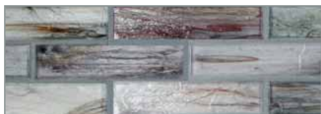
1 x 4 Brick (25mm x 100mm)