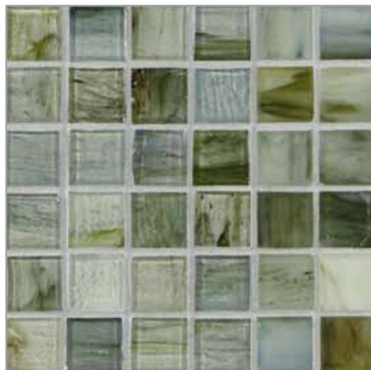
Natural | Silk Strontium