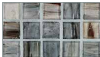
1 x 1 Mosaic (25mm x 25mm)