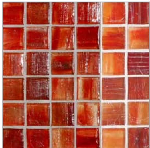
Natural | Silk Marrakech Red