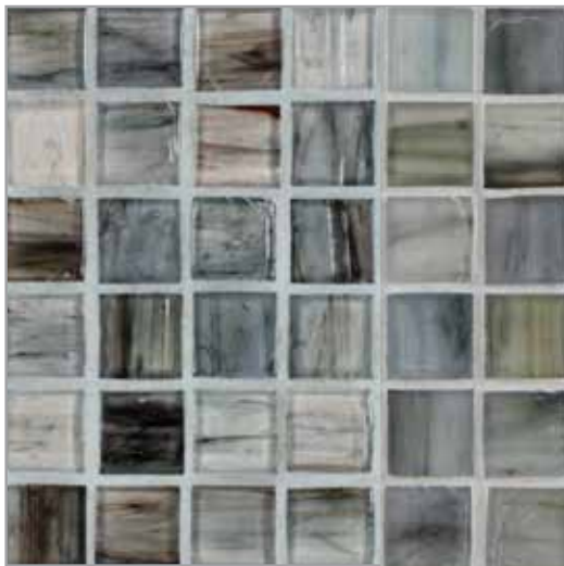
Natural | Silk Oxygen