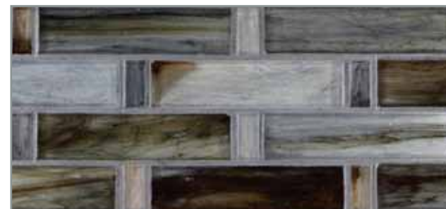
Tresse (1/2 x 1 & 1 x 4) (11.5mm x 25mm, 25mm x 100mm)