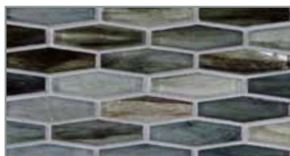
Martini (5/8 x 2) (16mm x 50mm)