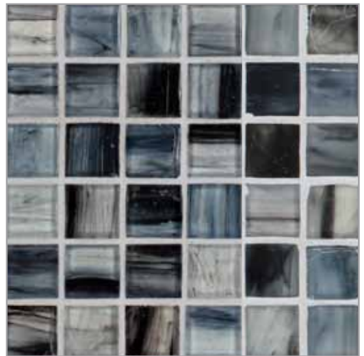
Natural | Silk Argon