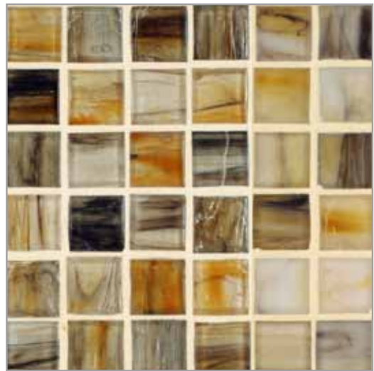
Natural | Silk Tin