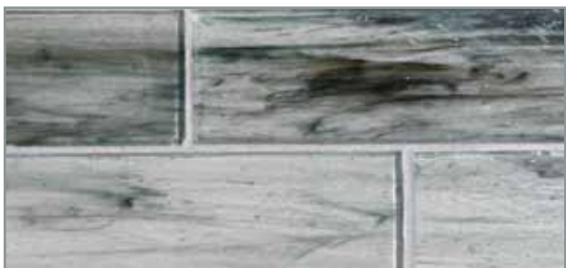
2 x 6 Brick* (50mm x 150mm)