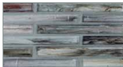
1/2 x 4 Brick (11.5mm x 100mm)