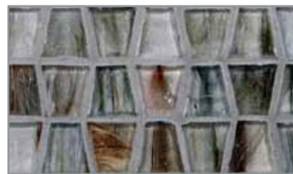
Wings (1 x 1) (25mm x 25mm)