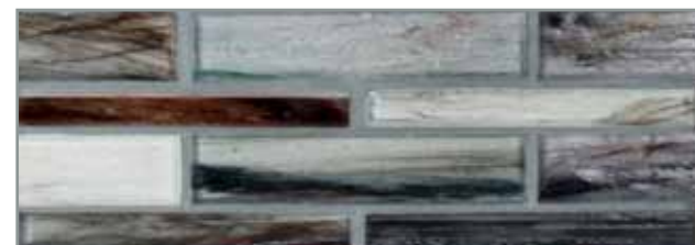
Moyou (1/2 x 4 & 1 x 4) (11.5mm x 100mm, 25mm x 100mm)