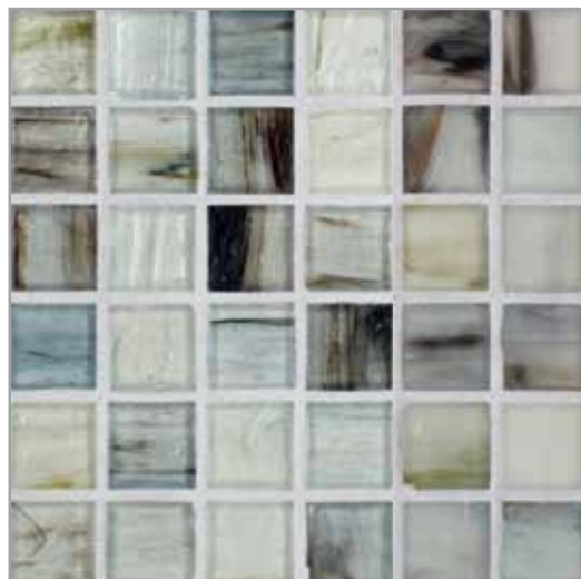
Natural | Silk Arsenic