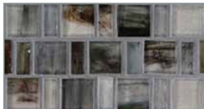
Japonaise (1/2 x 1 & 1 x 1) (11.5mm x 25mm, 25mm x 25mm)