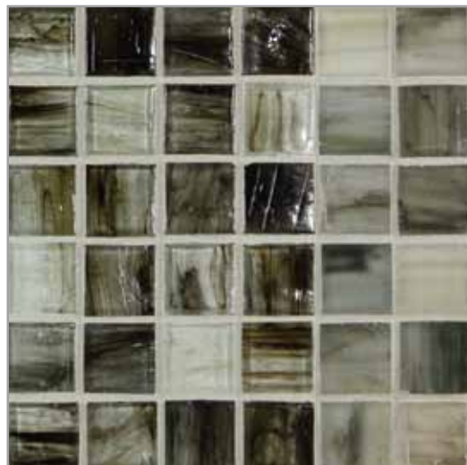
Natural | Silk Nickel