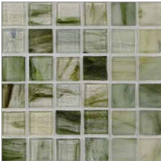
Natural | Silk Selenium