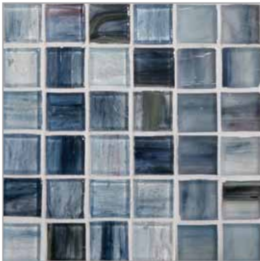
Natural | Silk Tanzanite