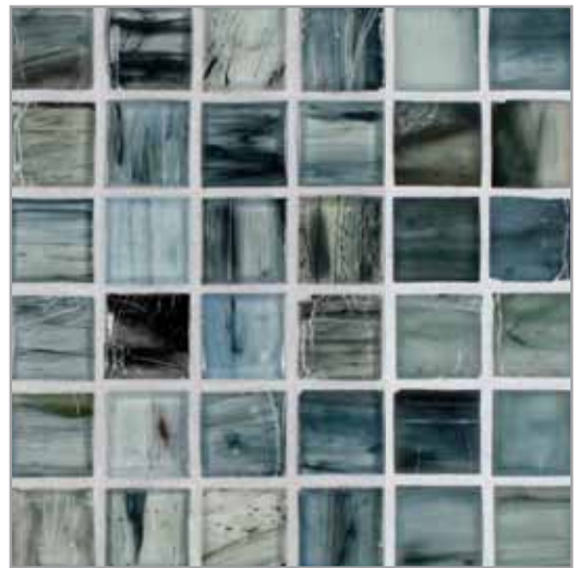
Natural | Silk Iodine