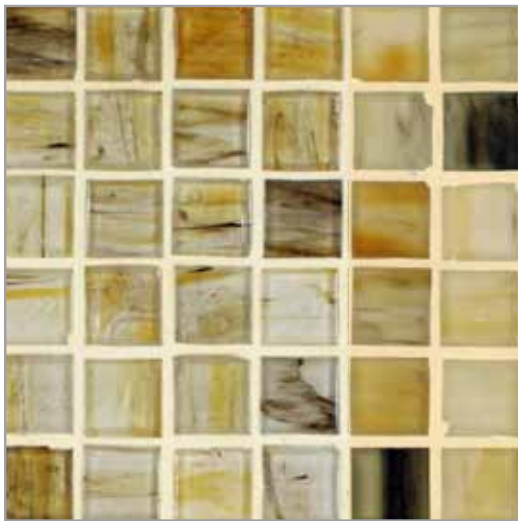
Natural | Silk Yttrium