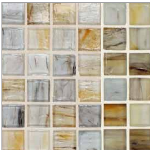
Natural | Silk Indium