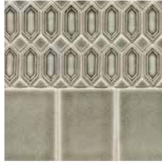
Velvet Gloss Crackle