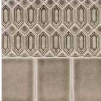
Suede Gloss Crackle