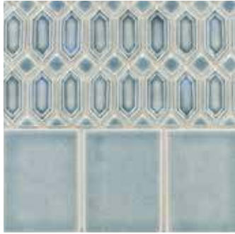
Blue Shadow Gloss Crackle