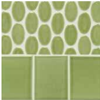
Key Lime Gloss