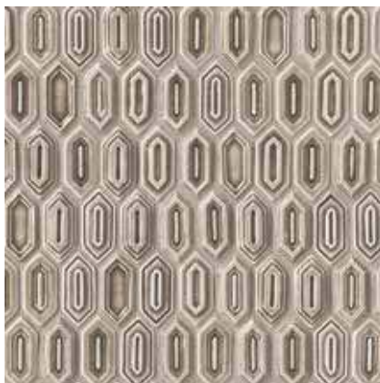
Lounge Mix Mosaic* 1" x 2 1/4"