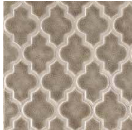
Ashbury Mosaic 3" x 4"