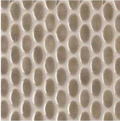
Oval Mosaic 1 1/4" x 2"