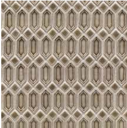
Odyssey Mosaic* Hexagon is 1" x 2 1/4"

Vibe offers a fresh direction in wall tile, inviting you to cover entire walls with intricate patterns and saturated color. The collection's bold shapes and extravagant hues were inspired by designs from the 1960s and '70s, when creative visionaries like fashion designer Emilio Pucci and interior designer David Hicks redefined the visual world. Vibe weaves these influences into a tapestry of tile treatments, from playful, organic forms to crisply modern angles. Whether you long to fully "funkify" your pad or just add retro pizzazz to your backsplash, Vibe's got you covered.