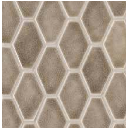
Hustle Hex 2 3/4" x 4 3/8"