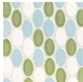
Fresh Blend* Gloss