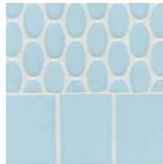
Powder Blue Gloss