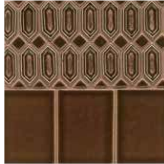
Boogie Brown Gloss