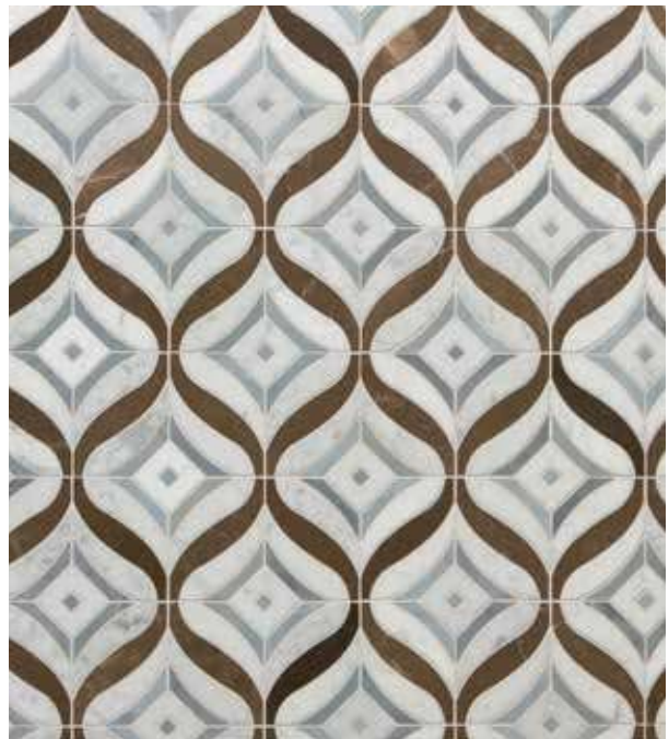
Mai Tai Cadet Blue