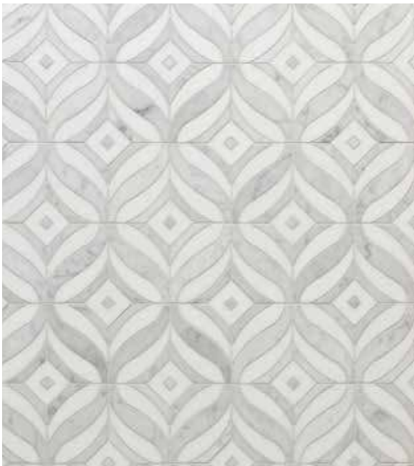
Mai Tai Carrara