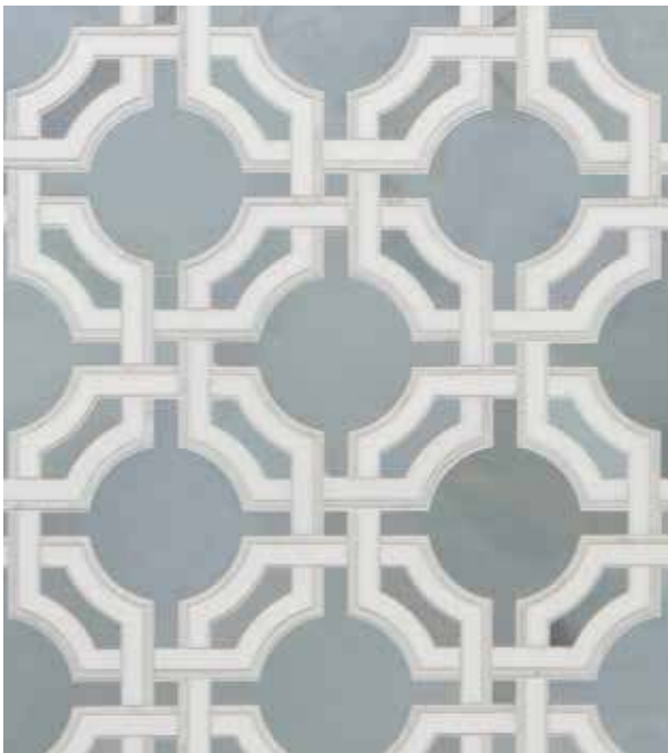
Cabana Cadet Blue