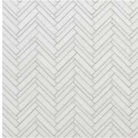
Lounge Mosaic Thassos White