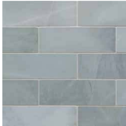
Cadet Blue Honed 3" x 8" field