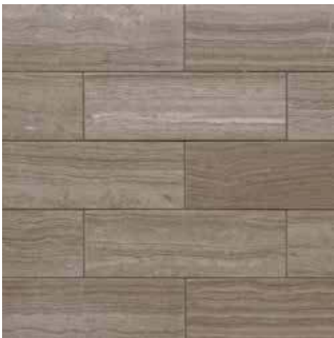
Mocha Honed 3" x 8" field