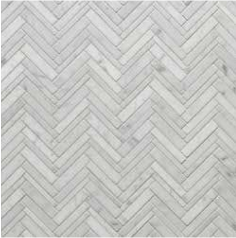
Lounge Mosaic Carrara White