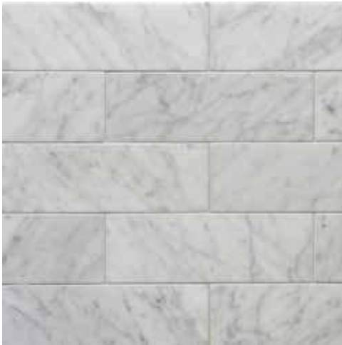
Carrara Honed 3" x 8" field