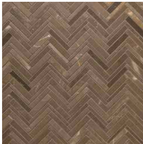
Lounge Mosaic Café Bruno