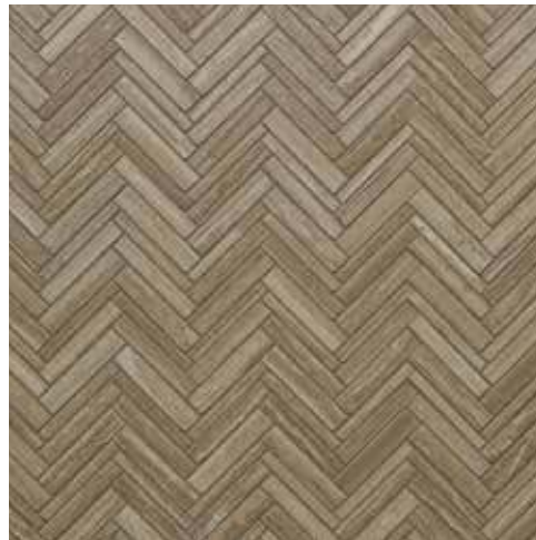
Lounge Mosaic Mocha