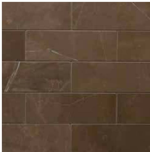
Café Bruno 3" x 8" field