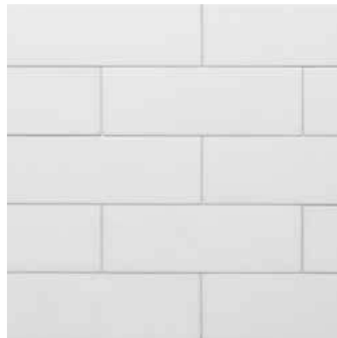
Thassos White 3" x 8" field