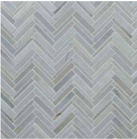
Lounge Mosaic Cadet Blue